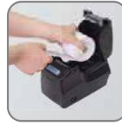
Paper Easy loading

Widely used in bill printing in lottery, supermarkets, restaurants and chain stores.etc